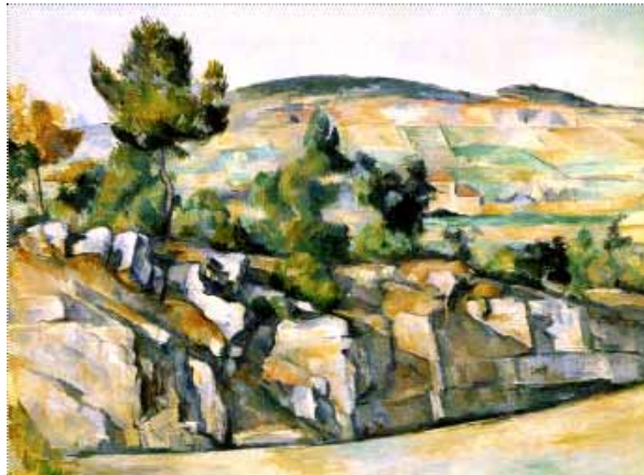
Mountains in Provence