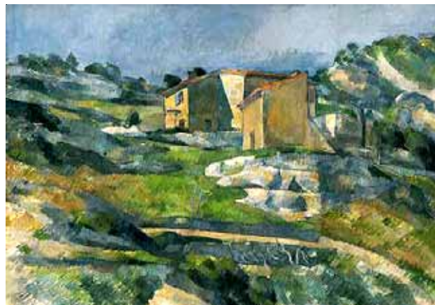
The Riaux Valley near L'Estaque

Paul Cézanne was a French painter, often called the father of modern art, who strove to develop an ideal synthesis of naturalistic representation, personal expression, and abstract pictorial order.